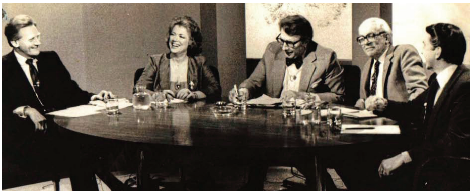
On Question Time with Michael Heseltine, Robin Day, Michael Foot and David Steel, 1983