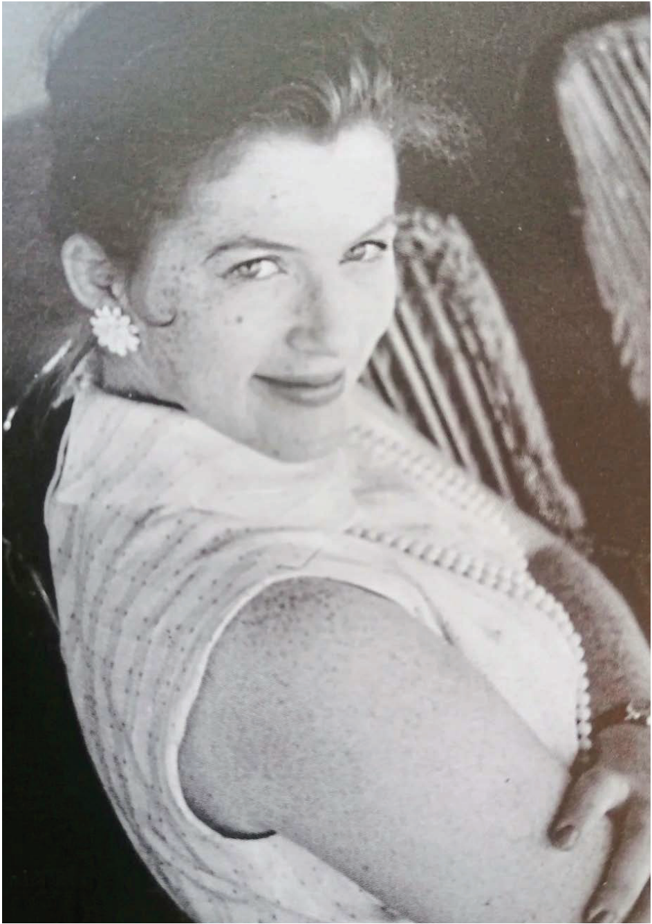
A teenager in Karachi – ‘By then I’d discovered make-up and was aiming to look at least 30’