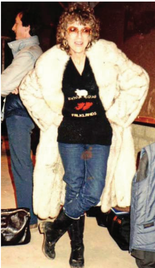
At Stanley Airport, Falklands, 1982