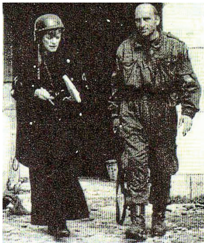
With a Bosnian Serb soldier near Gorazde, 1994