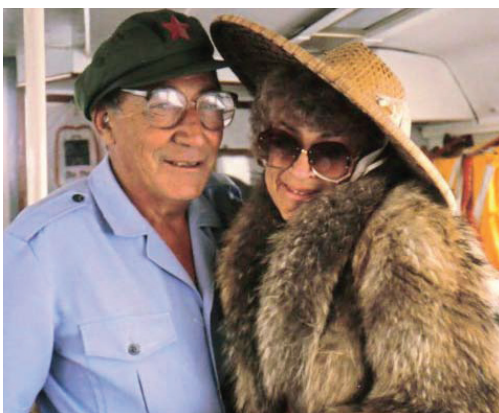
With photographer Monty Fresco on a train in Guangdong, China, 1986