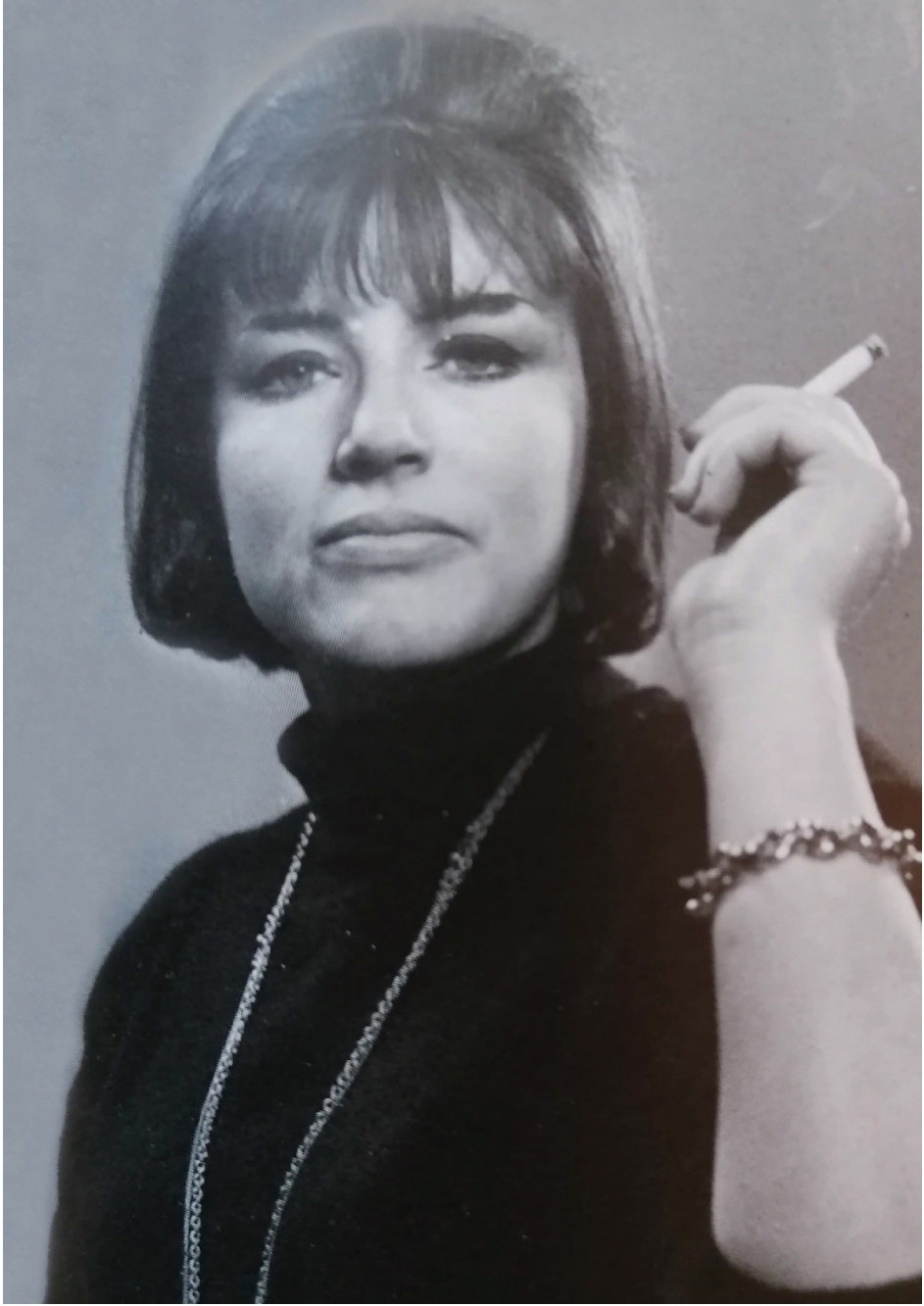
As a 'Young Meteor' in Fleet Street: 'fag-ash Lil' in 1965