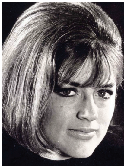
At the Daily Mail, 1965